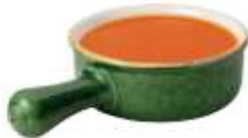
Tomato soup 200 gram (half a large tin)