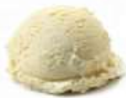
Plain vanilla ice-cream 1 large scoop