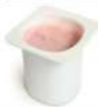
Low fat yoghurt 150 gram (1 small pot)